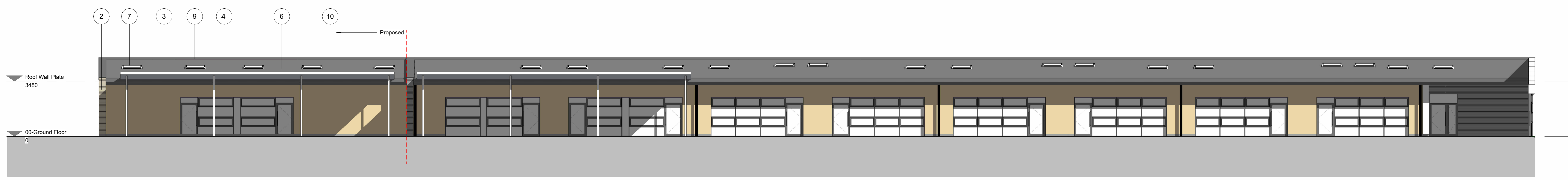
1 Nursery Extension - East Elevation 1 : 100

General Notes 1. Contractor to verify all dimensions and check level datums on site 2. All of the designs are the sole property of TACP Architects Ltd and may not be used without their written agreement 3. All prints, specifications and their copyright are the property of TACP Architects Ltd 4. Do not scale off drawings 5. All dimensions shall be checked on site before commencement of shop drawings, manufacture and all discrepancies must be reported to TACP Architects Ltd