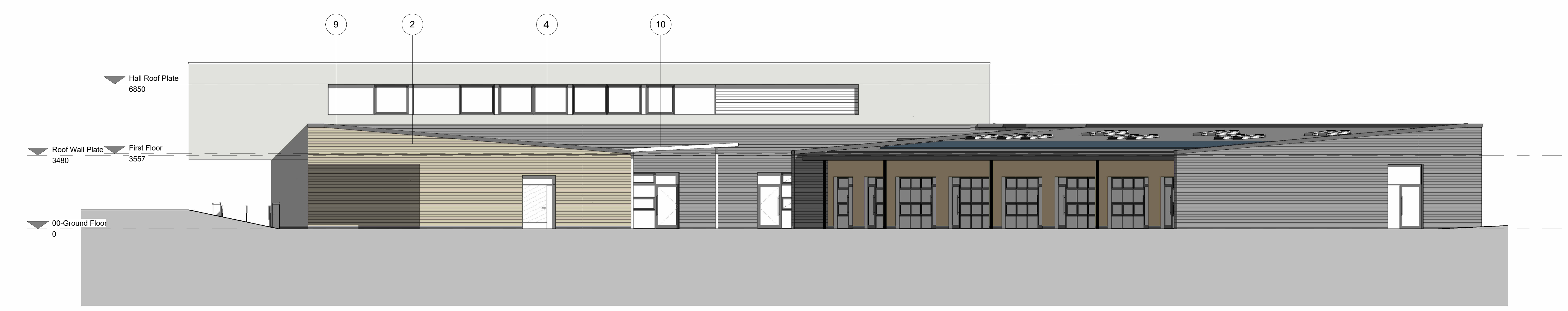
2 Nursery Extension - South Elevation 1 : 100